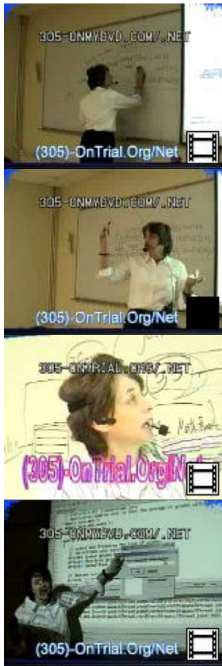
Thumbnail 5 & 6

Thumbnail 5 & 6 describe white board instructors notes and another 2 of 10,000 video clips, to be custom downloads, playback, or burns.