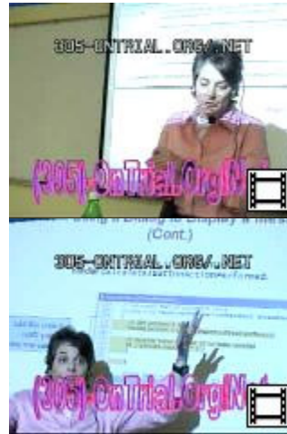
Thumbnail 3 & 4

Thumbnail 3 & 4 describe another 2 of 10,000 archived AVI clips describing the interaction of student and professor during the Java Business Programming class, to be custom burned or played back depending on AVIBTTB quiz results.