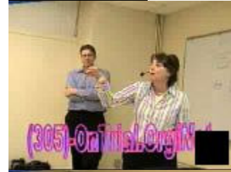
Thumbnails 9 & 10

Developed by Brown University, ReMarkable Texts provides a compelling student experience. With ReMarkable Texts, students can view the archived custom DVDs, playing them back at the next class for a public discussion. This public discussion can be recorded as another layer over the original custom DVD. "Students can annotate their classroom notes with ink, hyperlinks, sticky notes, and audio, and then can later search their notes by annotation type."