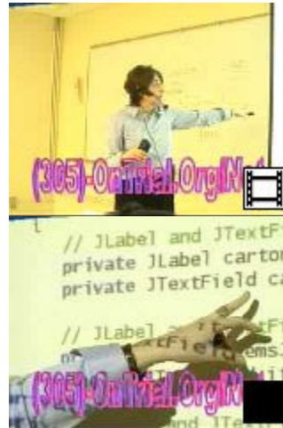
Thumbnails 1 & 2

Thumbnails 1 & 2 Show how each clip has a URL and a phone number ConferenceXP activity can continue outside the classroom. In a typical academic 40 instructor contact hours and 3 academic credit hours a week, during a fall and spring semesters, a DVDVR (DVD Video Recording) of an average of 4 hours per AVI DVD-R (Recordable), 4.2 Gig, 4 hours playback per disk (SSSD, Single Sided Single Density), will produce 10 such DVDs. If we divide each 4 hours DVD into 100 Chapter clips, then the average per clip will be shorter than 4 minutes, and we will have a total of 10 DVDs x 100 clips per disk = 1,000 clips per course per professor. A typical professor may teach from 2 to 4 such courses, producing up-to 4,000 clips per semester. Students may not want to watch all these clips, this is where AVIBTTB quiz system will help them custom download only the clips they need to review, excluding all other clips that the students demonstrated that they understood and do not need to review. AVIBTTB could pick to clips to review play them locally, remotely, download them for later playback, or burn them to a DVD/CD on a local or remote burner.