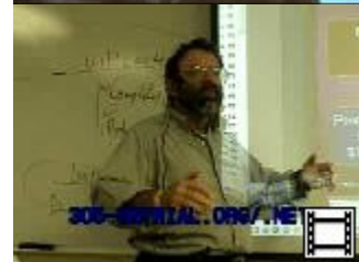
Guest Speaker CEO Classroom Presenter of Company Software